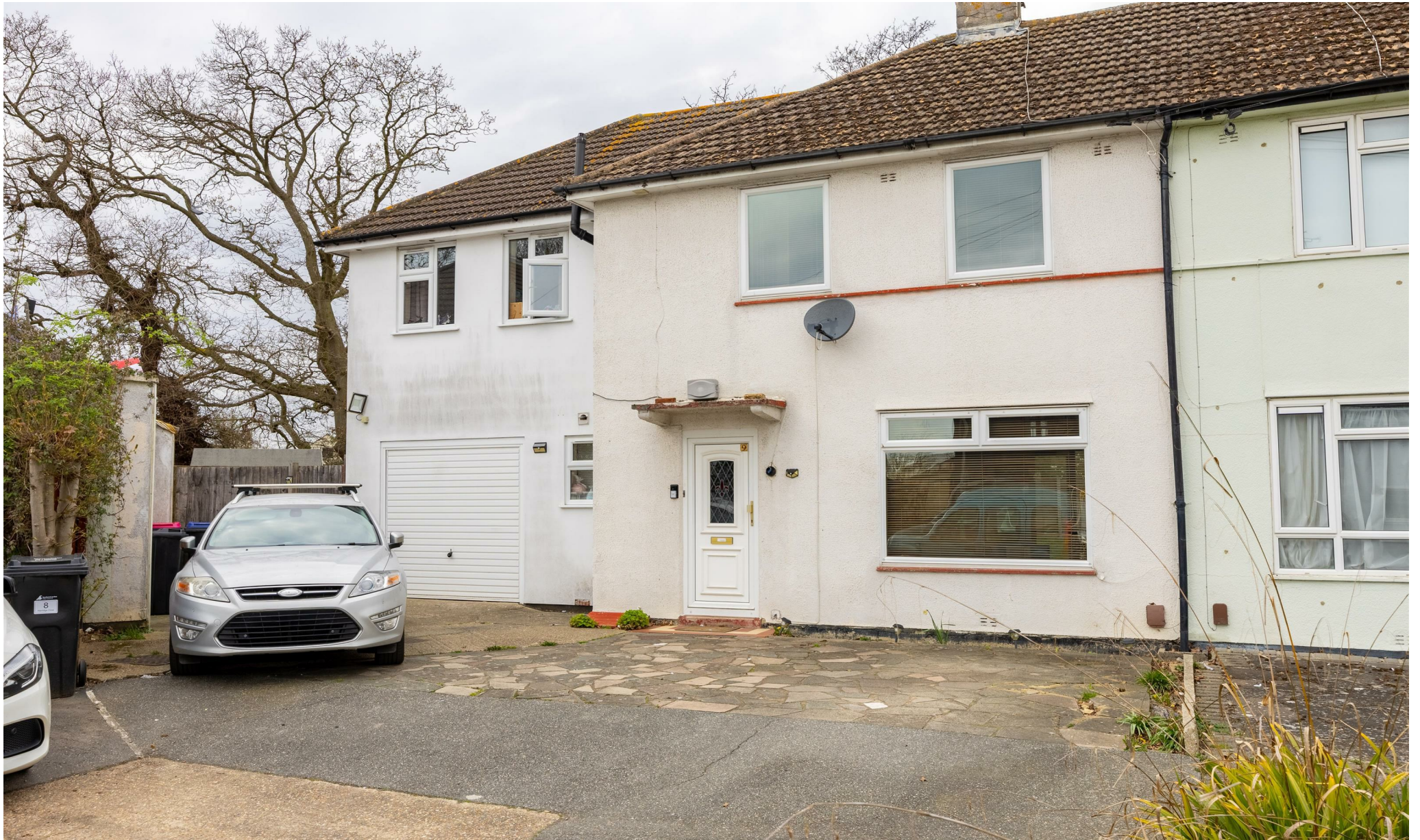
Harridge Close, Leigh-On-Sea £425,000